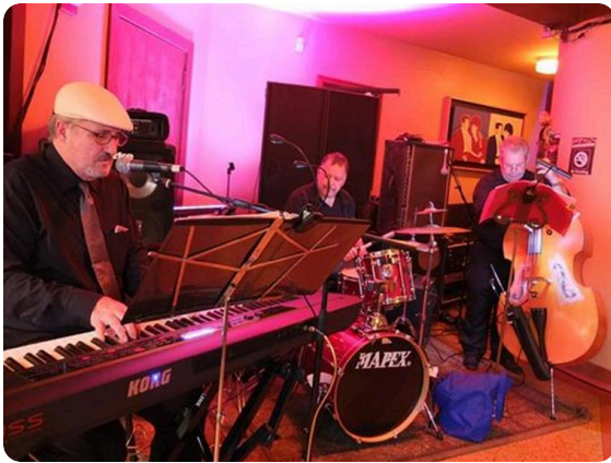
Doing a Christmas show at Cine El Rey